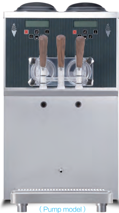
( Pump model )