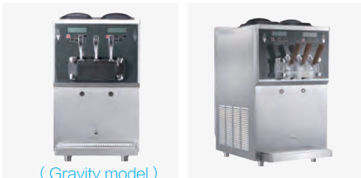
( Gravity model )